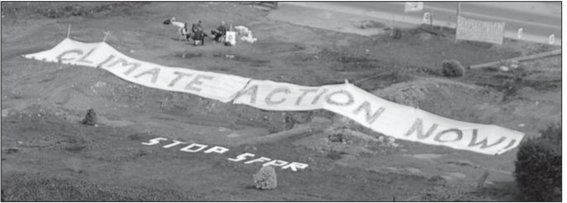
GatewaySucks.org and the Council of Canadians (Delta/Richmond chapter) unfurled a massive banner on land that has been slated for freeway construction. Historic homes and Indigenous sites are being demolished or are under threat from the South Fraser Perimeter Road (SFPR) on banks of the Fraser.