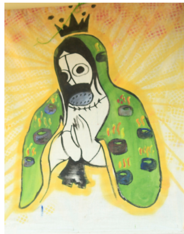
GRAFFITI FROM OAXACA, MEXICO

Jan 16 5pm • Winlaw Venue: Sleep is for sissies • 5622 Highway 6