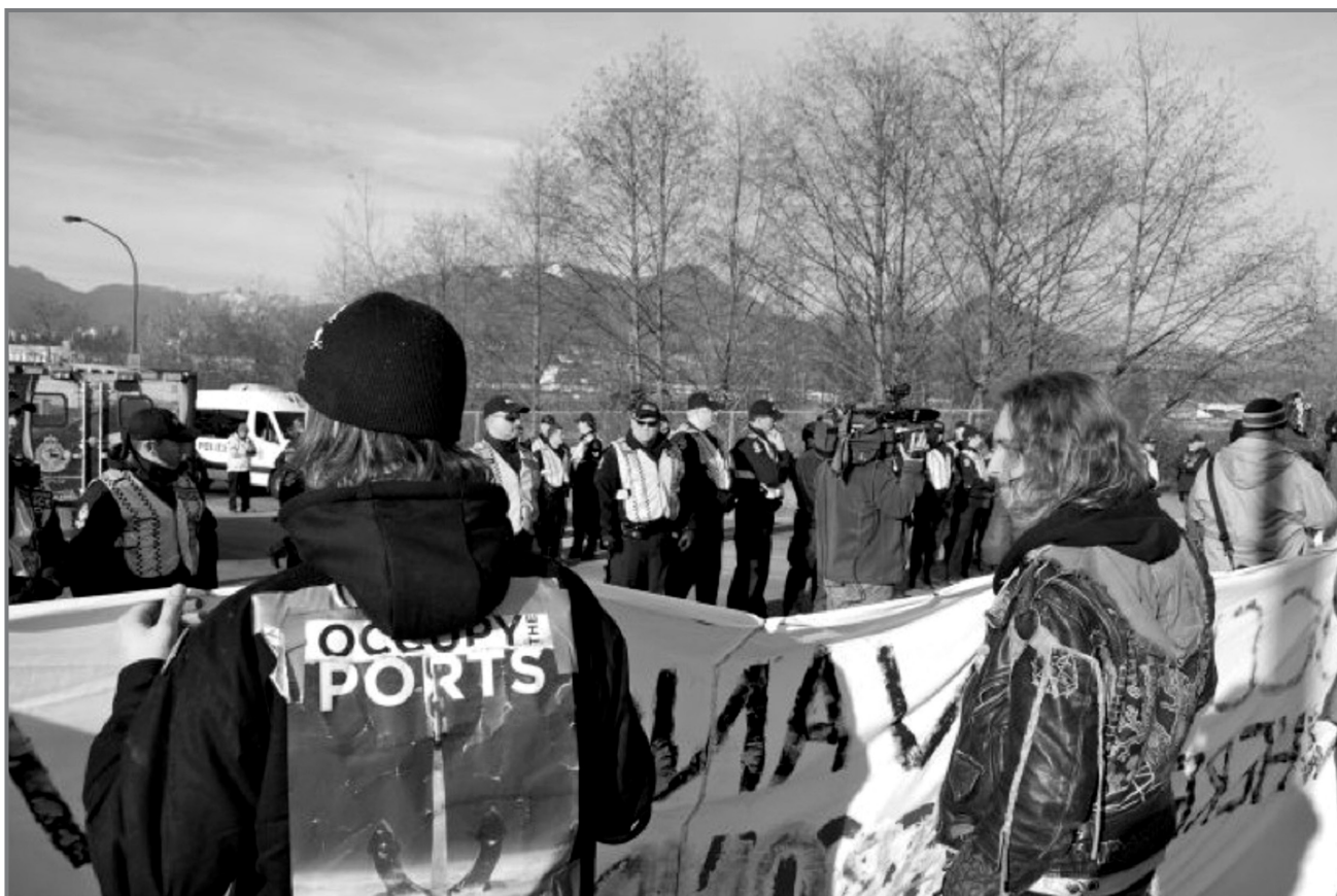
Occupy the Ports demonstrators face off against Vancouver Police line.

Stretched across the road at the bottom stood a single row of police officers, with chain-link fencing abutting either side of the road. At 1:30 pm the crowd halted in front of the police line. Police forces in the direction of the port numbered 30-35. Eventually two police