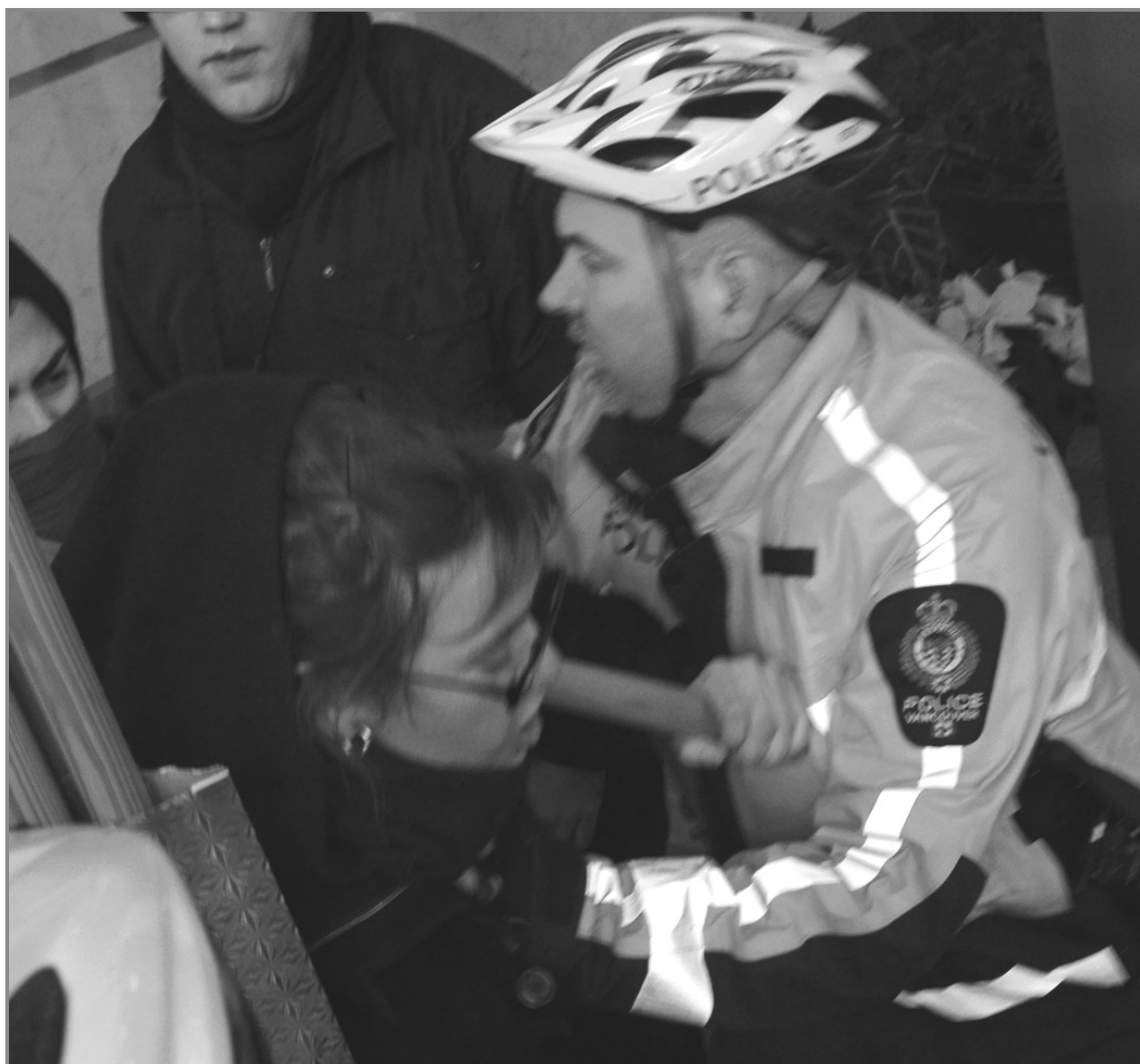
Out of control cop goes for the throat to protect pipeline company from peaceful protest.

Following on contradictory reports from police and a good deal of confusion, it soon became clear that the five arrestees had been released without charge.